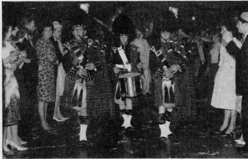
Piping the Old Year out and the New Year in at the Solihull celebration. The pipers are from the Standard Company band.