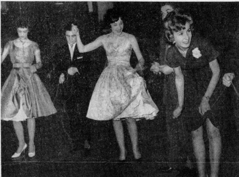
All strung up . . . a spot of fun at the Staff Party.

The grown-ups, too, had their celebrations. At the Staff Party, held in the Solihull canteen on December 16, over 600 staff employees joined in to make it a great success.